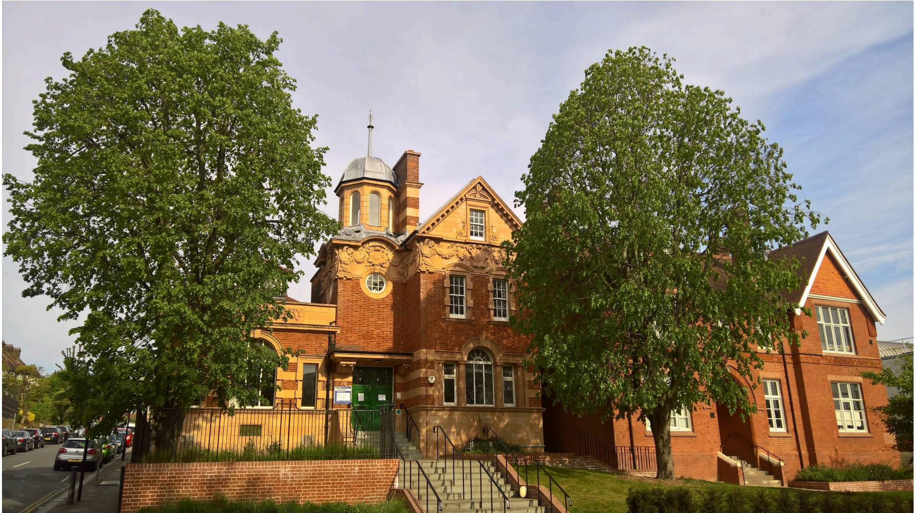
V22 FOREST HILL LIBRARY